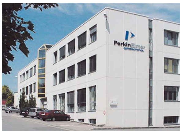
PerkinElmer HQ in Wiesbaden, Germany